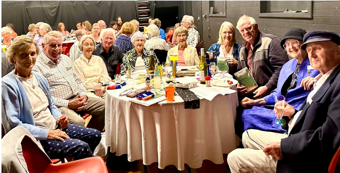
Arsenic and Old Lace at Beaumaris Theatre Company