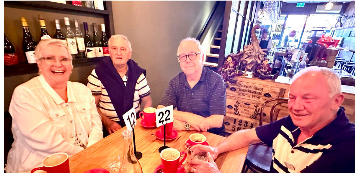
Coffee with the Committee