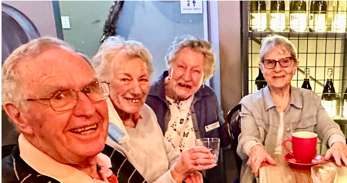
Coffee with the Committee